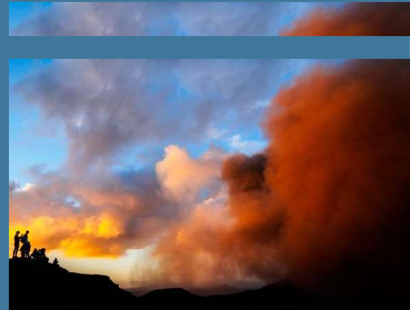
Mount Yasur active volcano

The tax haven of Vanuatu provides excellent offshore banking and banking services to private individuals and corporations. Vanuatu offshore banking centre is very active with numerous banks having received license to provide offshore banking services. Vanuatu has a number of international banks' branches and agents providing services to the public. As a tax haven Vanuatu offshore bank accounts pay no taxes on interests earned.